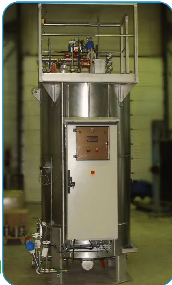
design: Norman Quast - © 2015